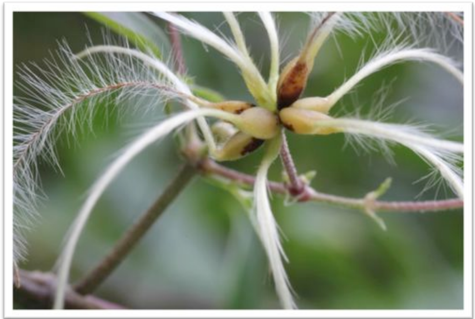
Virgin's Bower ( Clematis virginiana ) on the tree south of the drive near the street.